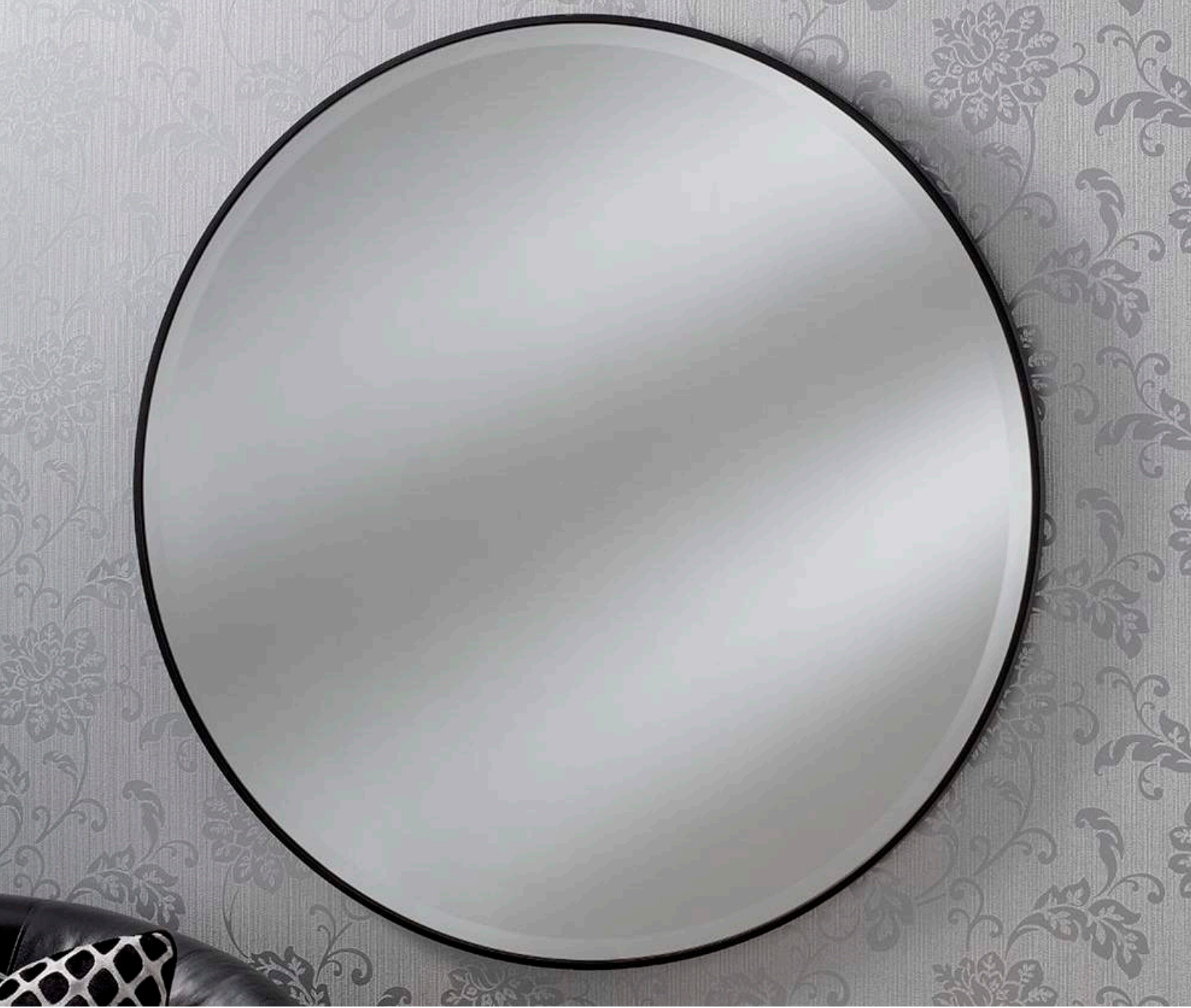
Camden Black Circle 60cm Diam. 80cm Diam. 100cm Diam.