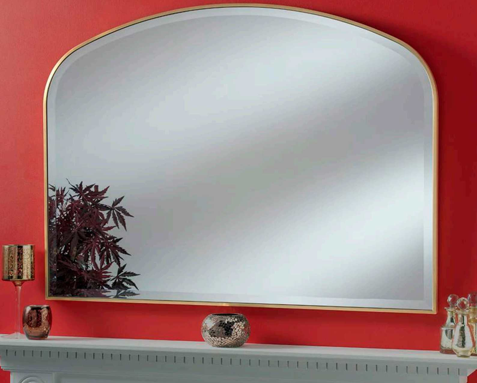
Camden Gold Overmantle 107cm (W) x 79cm (H)