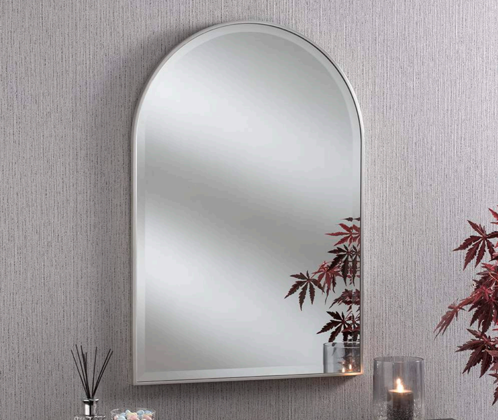
Camden Silver Arch Top 93cm (H) x 63cm (W)