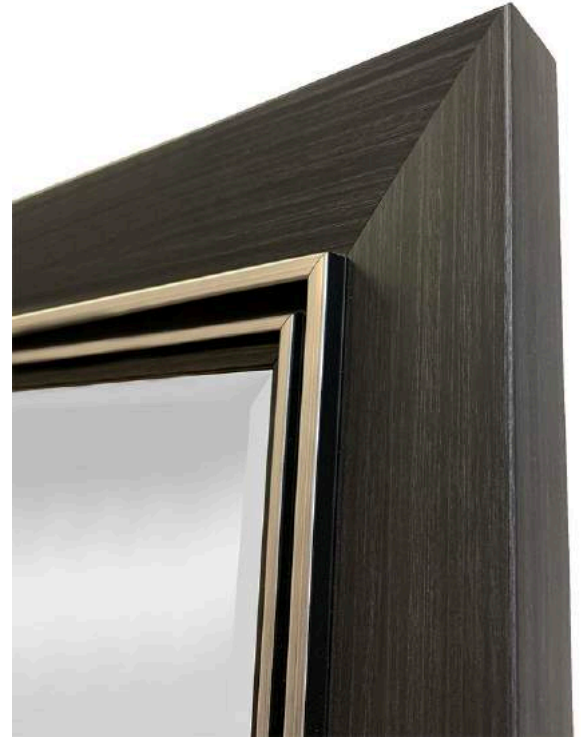
San Marino Coal 91 x 65cm 106 x 75cm 116x 91cm 167 x 75cm