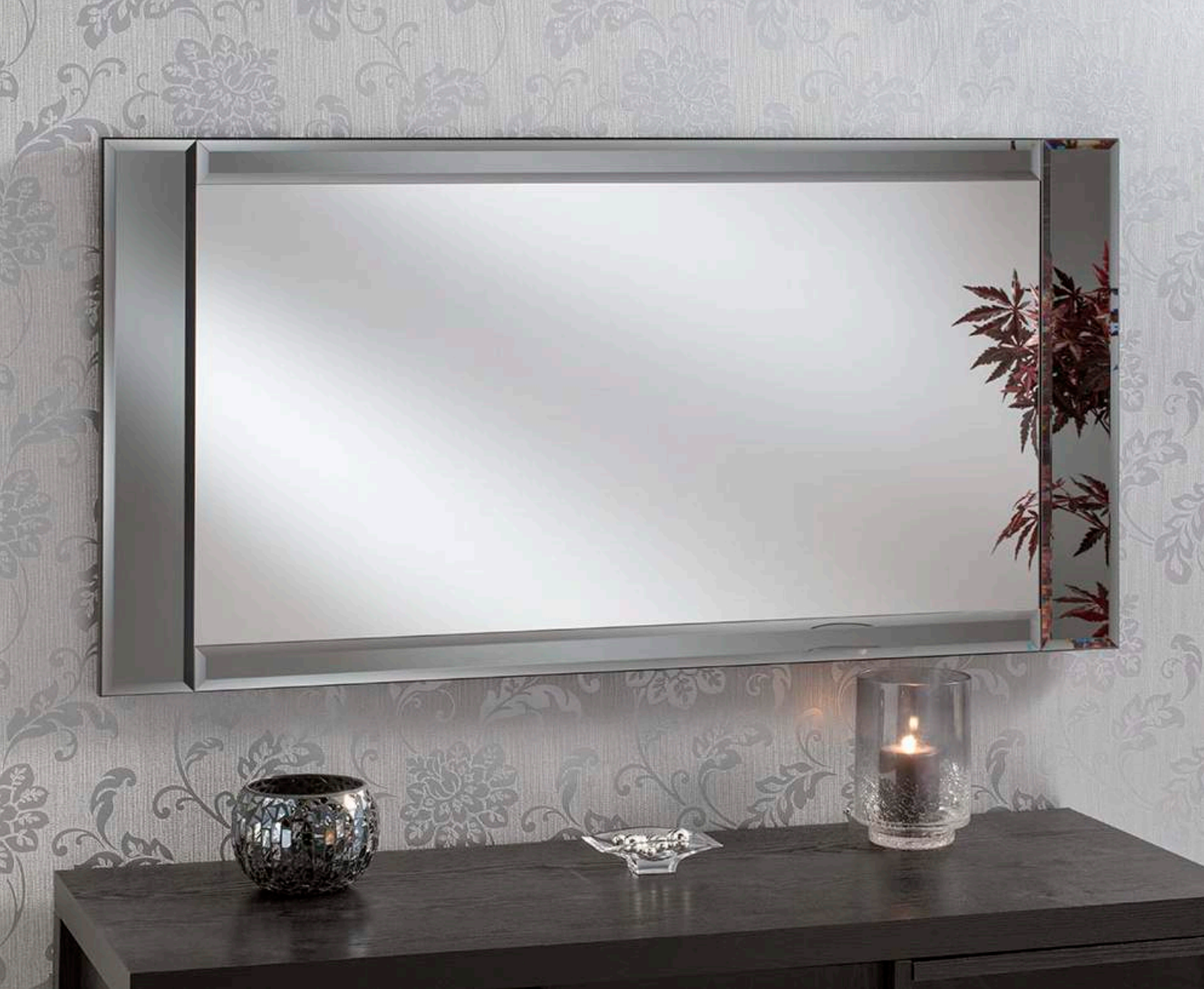
Windermere Grey 120 x 61cm