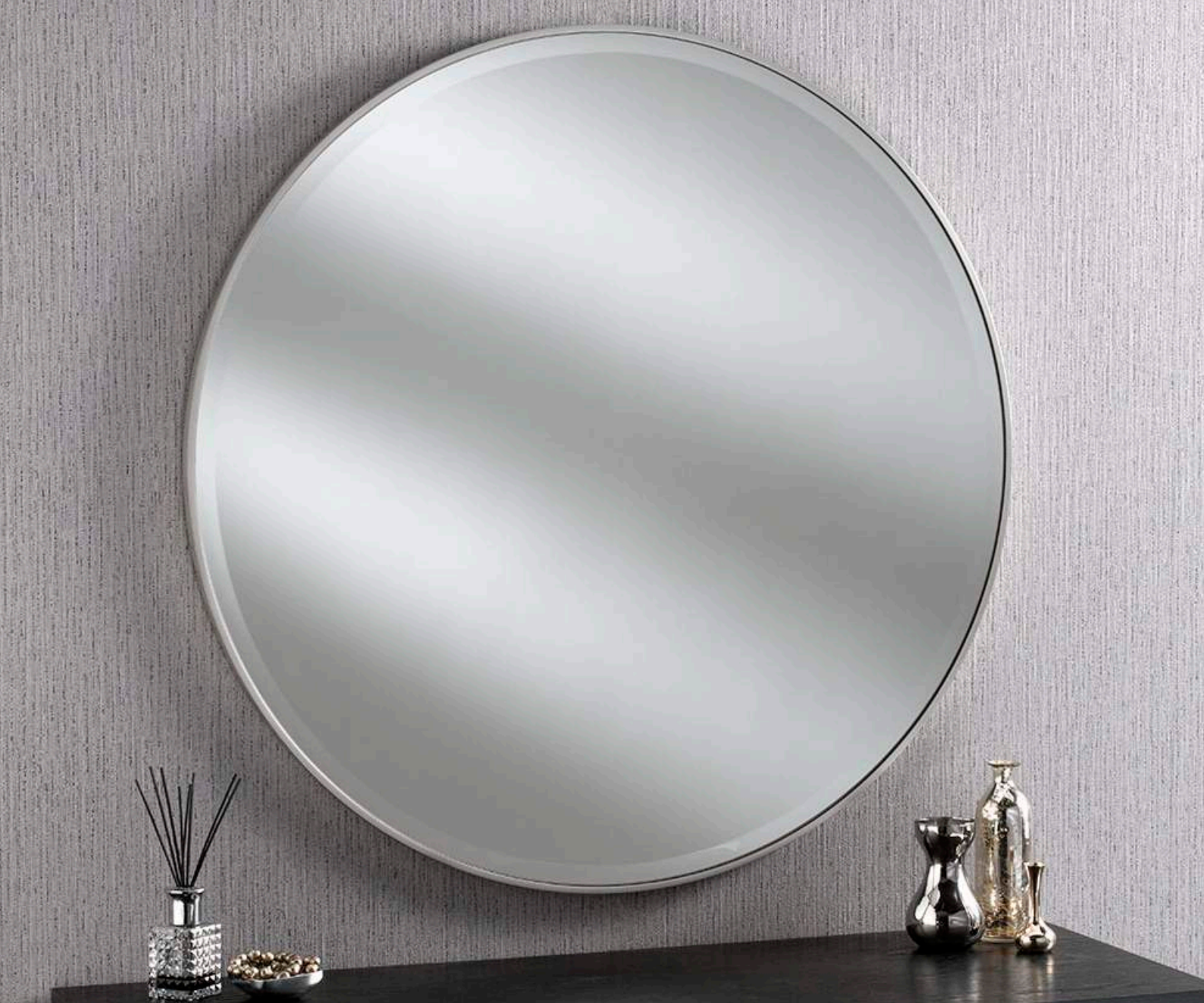
Camden Silver Circle 60cm Diam. 80cm Diam. 100cm Diam.