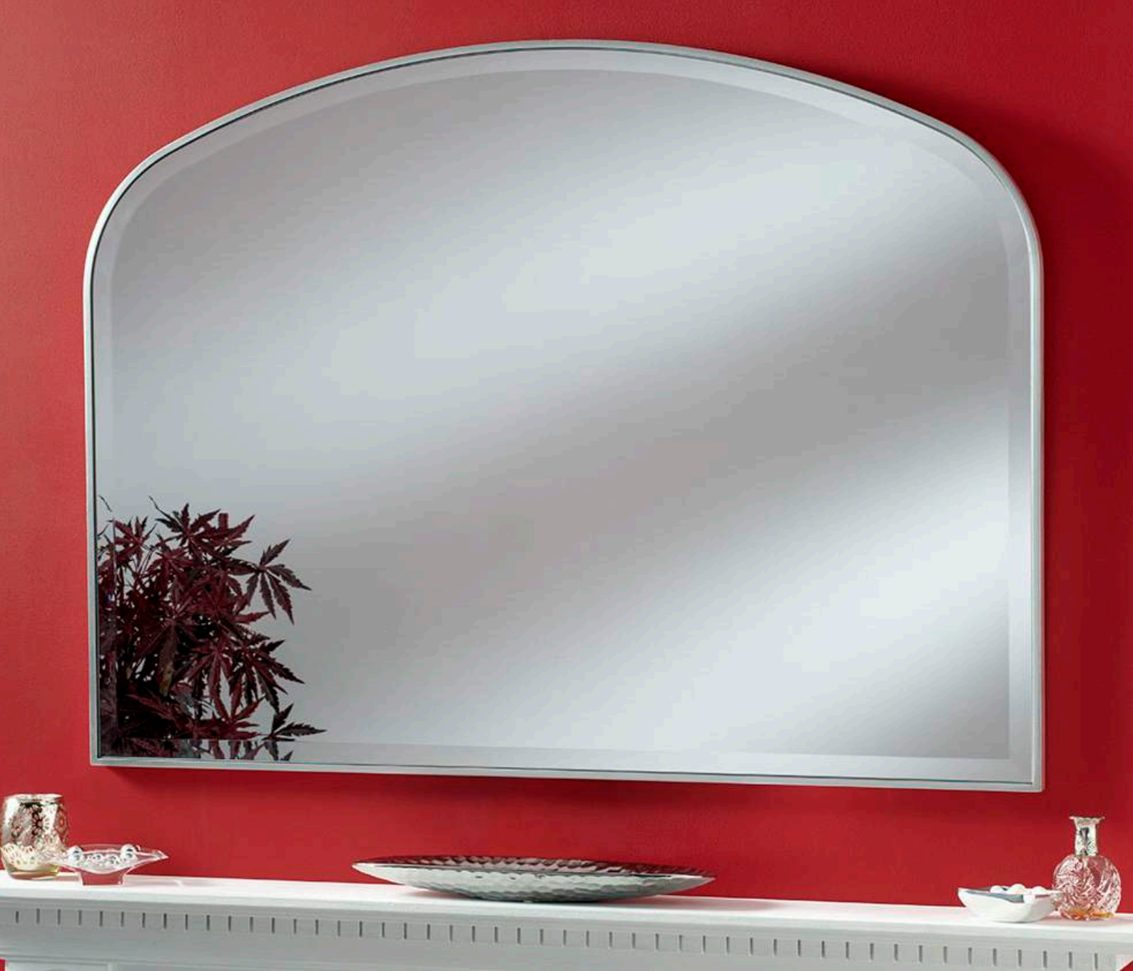
Camden Silver Overmantle 107cm (W) x 79cm (H)