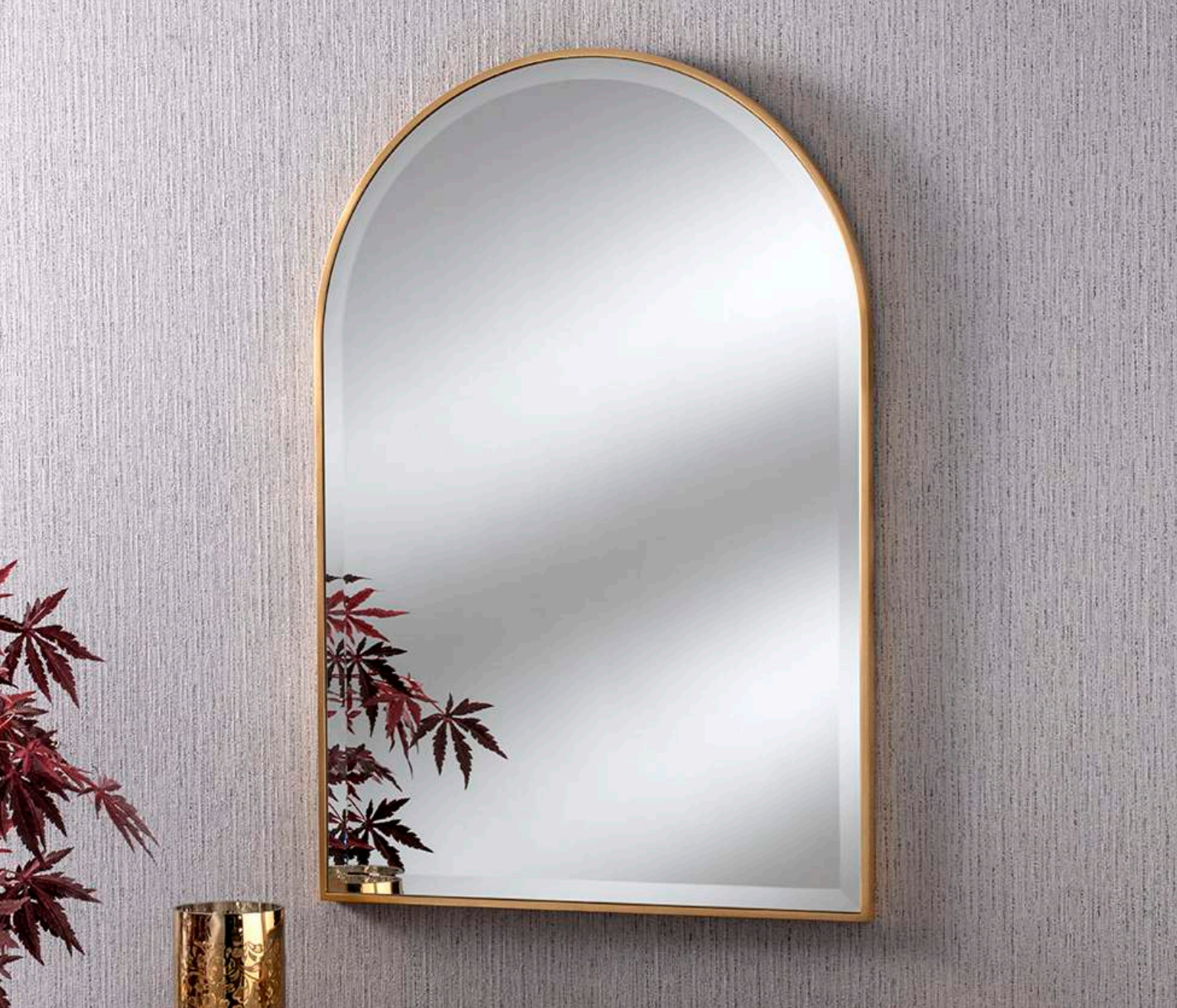
Camden Gold Arch Top 93cm (H) x 63cm (W)